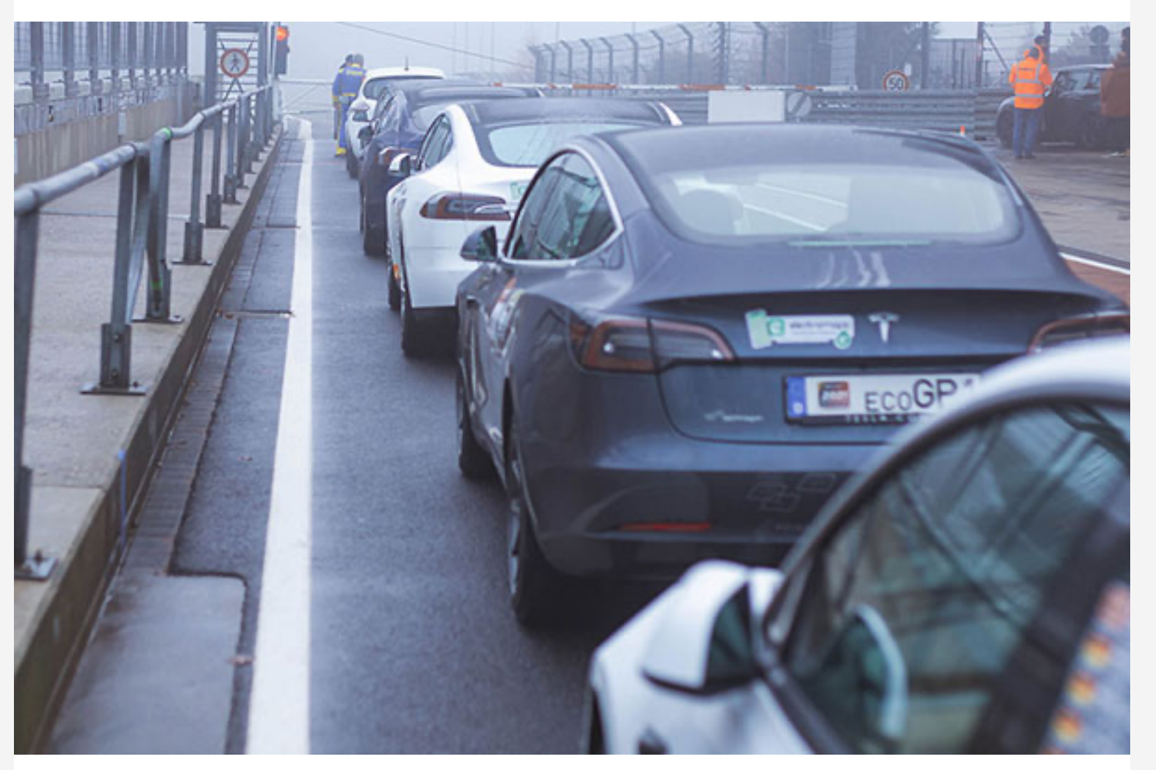
Planned Tesla world record parade setup

The ones from the 57 Teslas and 11 electric vehicles registered last year for the world record event who kept their ticket will be treated as VIP guests.