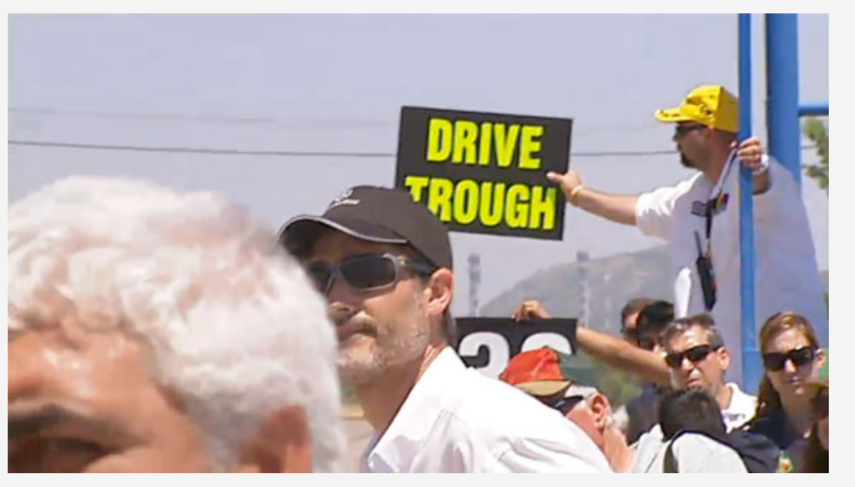
First eco Grand Prix in Spain 2013 together with ecoSeries - including funny Spanish accent :)